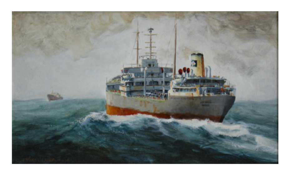
Yves Bérubé, CSMA