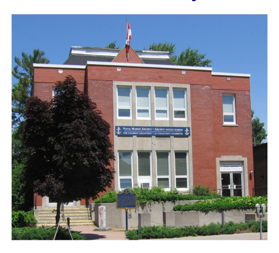
Home of the