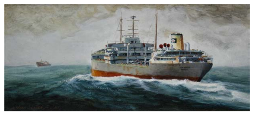
Yves Bérubé, CSMA Vate Brovig